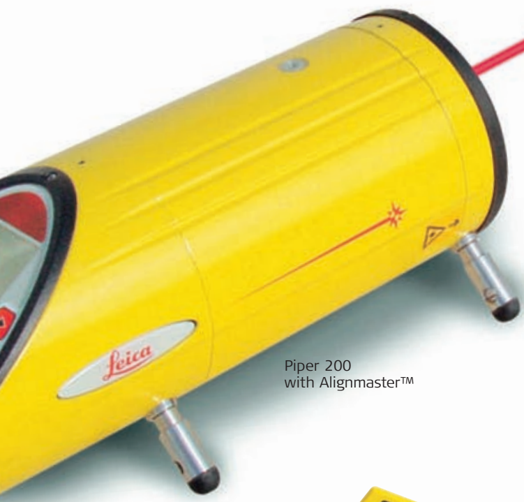
Piper 200 with Alignmaster™