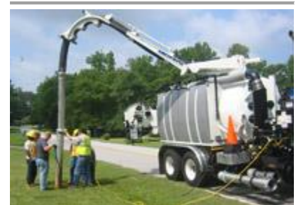
Hydro excavator package

Safety lighting – strobes, beacons, arrow boards, light boards