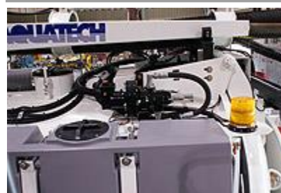
Multi-flow valve (unloader valve)

Pump off – 180 GPM standard, 300 and 500 GPM optional