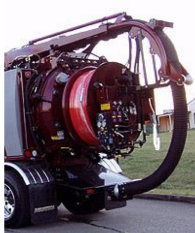
Jetting hose, 1” x 400 Ft. standard; optional lengths 500, 600, 800 and 1000 Ft. and optional diameter. \frac{3}{4} ” and 1.25”