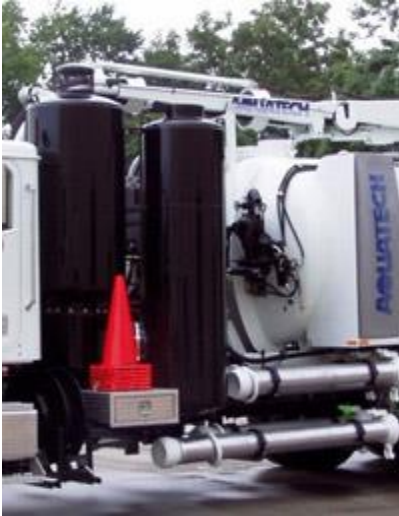
Higher vacuum blower (vacuum pump or exhauster) – 16” Hg. standard; 18” Hg. and 27” Hg. optional