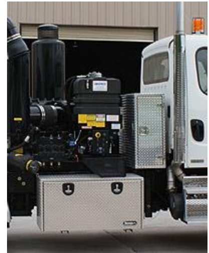
Tool boxes, cabinets, storage

Higher flow (GPM) and pressure (PSI) water pumps – B6 40 GPM@2000 PSI standard; B5, B10, B15 and B52 65 or 80 GPM@2000 PSI. Optional: 80 gpm@2500 PSI, 107 GPM@2000 psi, 125 GPM@ 2000 psi