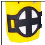
Auxillary filter kit