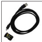
IR connectivity kit