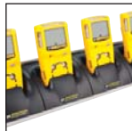
Five unit cradle charger

For a complete list of accessories, please contact BW Technologies by Honeywell.