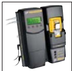
MicroDock II compatible