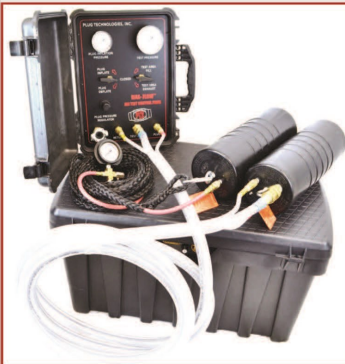
500-812 Tru-Test™ Max-AT™ Line Acceptance Kit