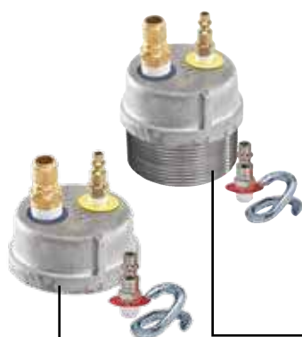
Hi-Flow™ Line Acceptance Conversion Kit Cap Version 3/4" Test Pressure quick connect