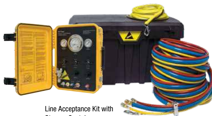
Line Acceptance Kit with Storage Container