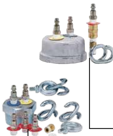
Leak Location Conversion Kit Plug Version 3/8" Leak Location quick connect