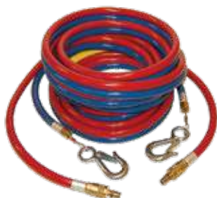
22' Interconnect Hose