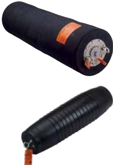
Protective sleeves available for 12"-18" diameter and larger plugs.