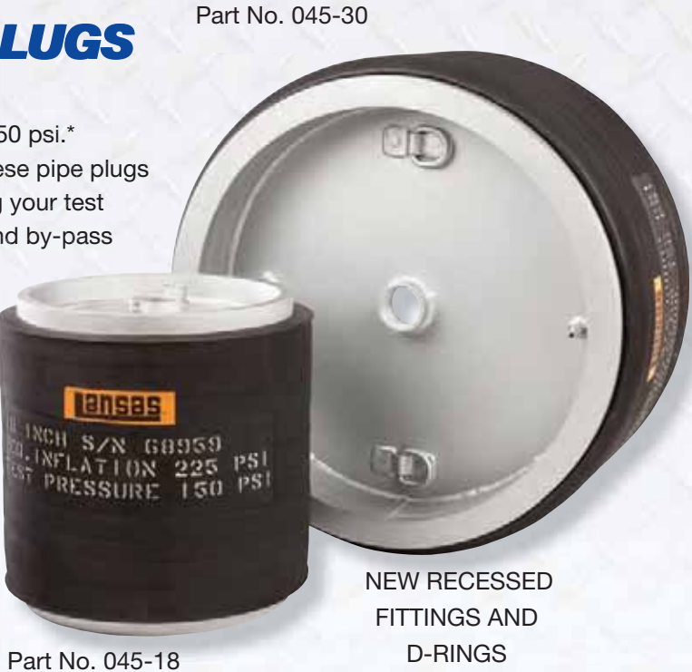
Part No. 045-18