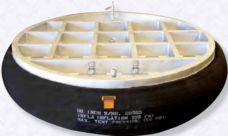
Part No. 045-66