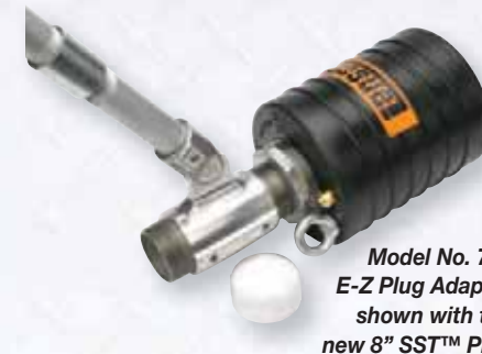
Model No. 705 E-Z Plug Adaptor shown with the new 8" SST™ Plug

The "E-Z Plug"™ system will utilize an adapter and either a new or existing single or multi-size test plug or by-pass plug. By using the "E-Z Plug"™ system you will eliminate the need to set up for confined space entry when installing test plugs. The time required to install a test plug will be reduced to only a few minutes. The cost will be reduced by thousands of dollars by eliminating ventilators, safety harnesses, gas detectors, and other costly equipment. The Lansas "E-Z Plug"™ system is designed to save time and money on every job. The "EZ-Plug"™ adapter can be used on any plug that has a removable 3/8" eye-bolt.