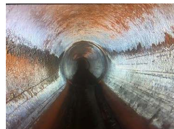
SUPERIOR ILLUMINATION AND SELF LEVELING