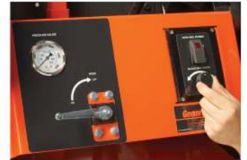
Easily accessible Variable Speed rewind control, along with pressure gauge and output valve mounted between hose reels.