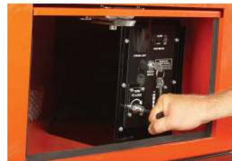
Remote control panel protected inside locked toolbox.

Standard safety features include electric brakes, safety strobe light, three safety cones with holder, rear fold down stabilizer jacks, and retractable guide arm. An anti-freeze system protects the unit from freeze damage. Complete with spray wand and trigger.